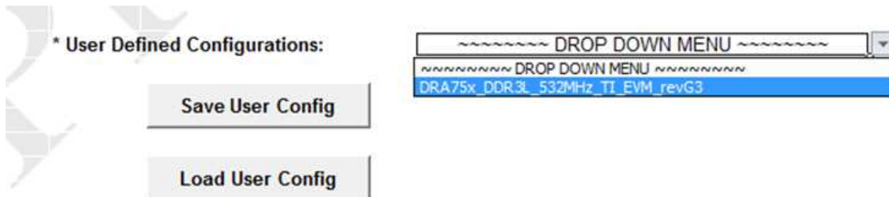
Figure 5. Saved User Configuration

After the configuration has been successfully saved, the configuration name will appear from the drop down box, illustrated in Figure 5. Each time a unique configuration is saved, the EMIF Tools source code is automatically updated.